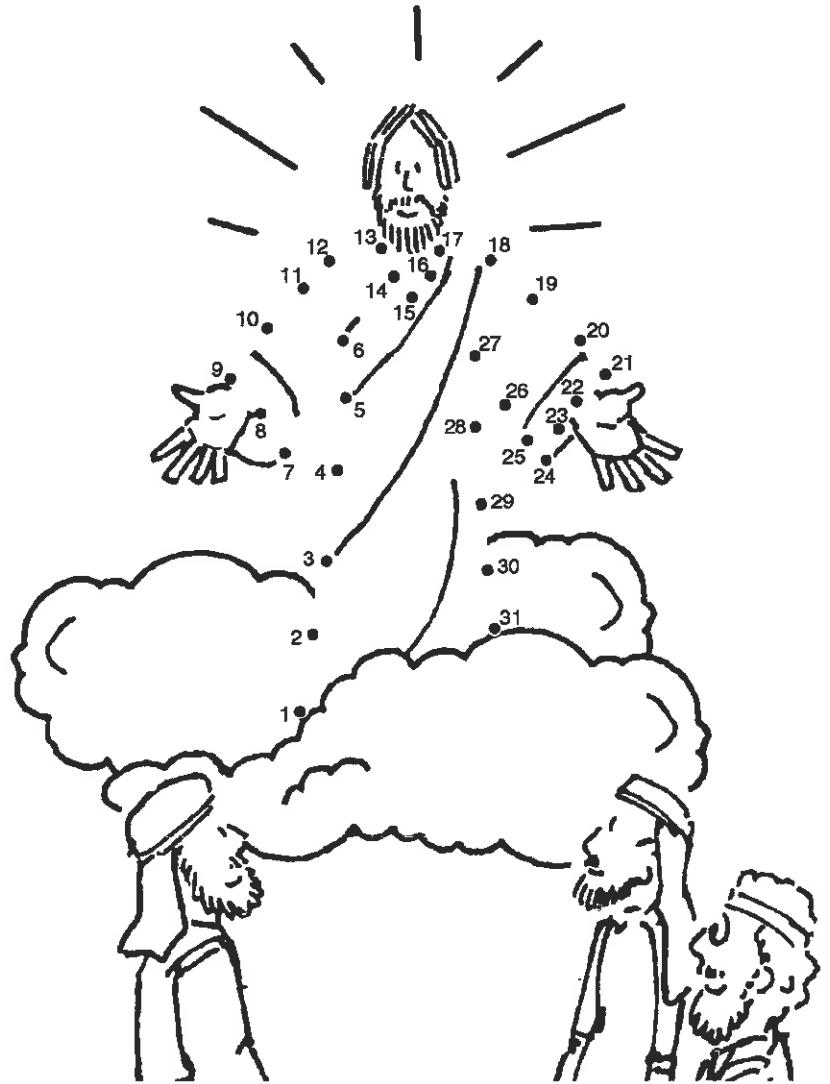
After He said this, He was taken up before their very eyes, and a cloud hid Him from their sight.